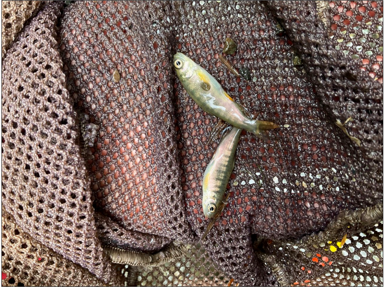
Figure 1.—Juvenile coho captured at waypoint 1395.